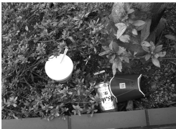
There is a lot of garbage like this on campus.

*ED'S NOTE: Garbage on campus is everyone's responsibility. Please do your part and help keep our campus beautiful.