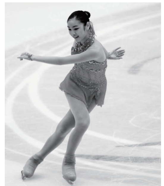
Yu-na Kim of Korea