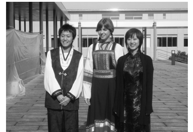
Many international members of the Hamada community came to the party.