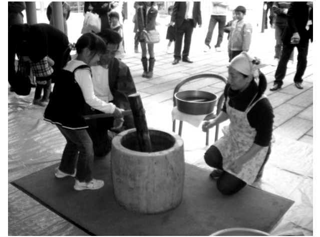
Making mochi, a traditional Japanese chewy rice cake often used for making sweets.

At the end of the Athletic Meet, the sophomore students got the first prize and they got a lot of instant cup-noodles. The other participant got gifts, too, so all of them were satisfied.