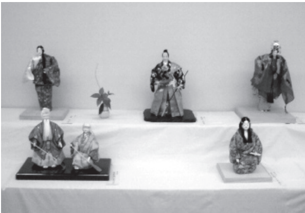
Beautiful traditional Japanese dolls made by a citizen of Hamada City.

The dramatic division classifies each performing art into 10 categories – Japanese drum, folk dance, the Hula (Hawaiian dance), koto (Japanese guitar), traditional Japanese dance, children's songs, No song (traditional Japanese song), Kagura (the traditional Hamadan dance), sword dance and the drama of poetry. 18 citizens' groups took part in the dramatic division. That is why visitors who visited the art festival enjoyed an especially artistic autumn.