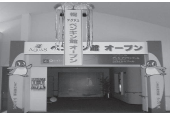
PHOTOGRAPHER: Yuta Yamamoto